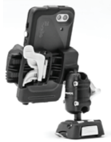
Universal Phone Clamp RL-509