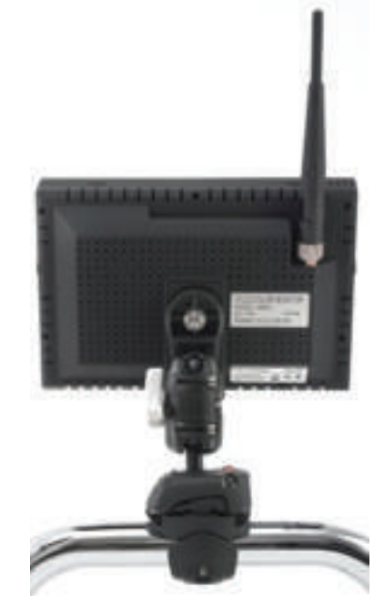
Screen Track Plate RL-514