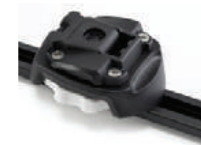
Kayak T-track RLS-407