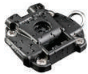
Surface Mount RLS-401