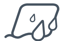
ON WATER TEST