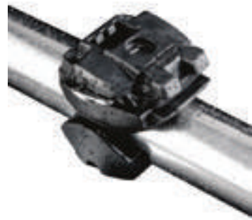
Rail Mount RLS-402