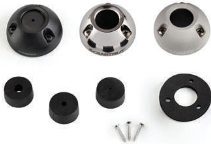
DS6 - DS40

Available in black/gray high-impact plastic or 316 stainless steel.