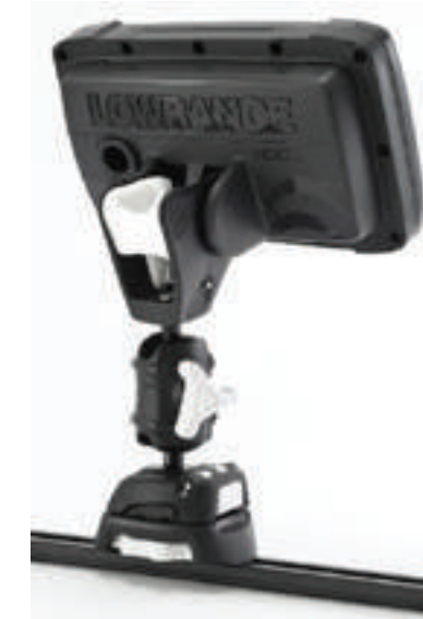
Lowrance HOOK2 Quick Release Adapter