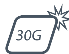
30G SHOCK TEST