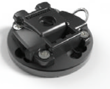
AMPS base adapter RLS-406