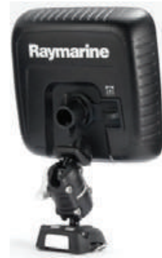
Raymarine Dragonfly RL-512