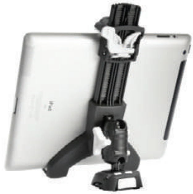
Universal Tablet Clamp RL-508