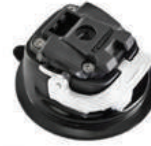
Suction Cup RLS-405