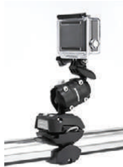
GoPro & Garmin RL-510