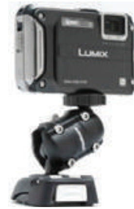
1/4" Camera Thread RL-511