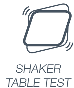
SHAKER TABLE TEST

Our commitment to quality has earned us the approval of renowned names such as Mercury Marine, Grady White Boats, Boston Whaler, Winnebago, Airstream and many more. To learn more about our testing program and certifications, please feel free to reach out to us.